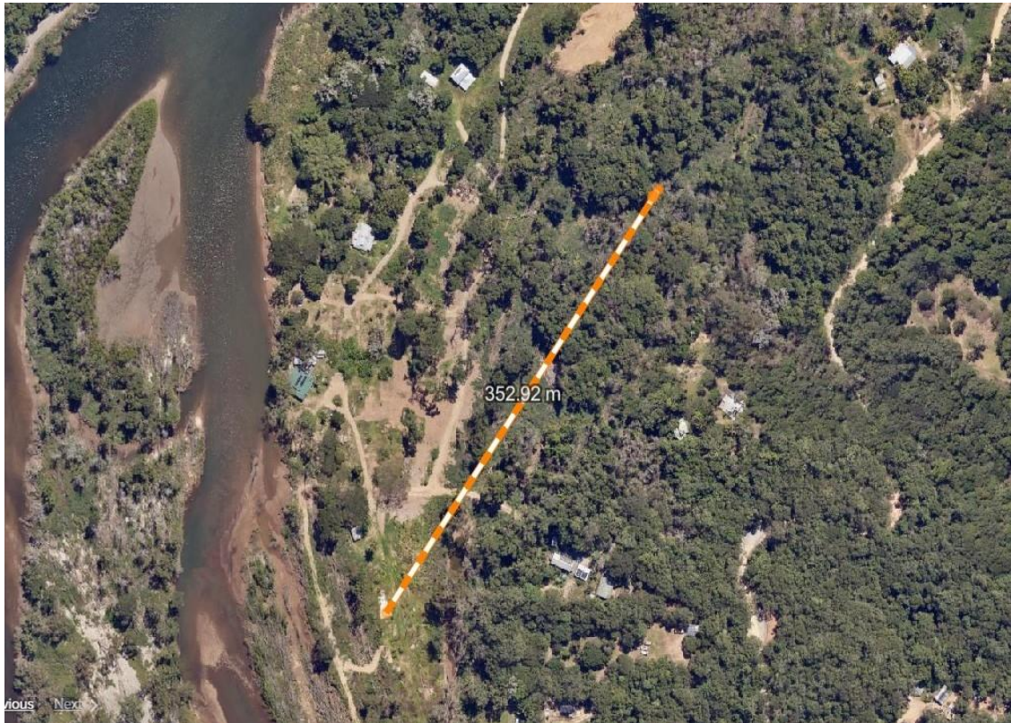
Image 5 – Aerial view of the location of Mr Dark’s boat in relation to Mr Dark’s residence